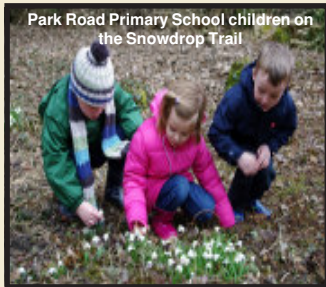
Park Road Primary School children on the Snowdrop Trail

West Fife Woodlands (WFW) was set up in 2006 with the philosophy of the preservation, enhancement and accessibility of West Fife's woodland areas. Their biggest achievement to date is perhaps 4km of path improvements from Newmills to Blairhall via Valleyfield Woodland Park, a £150,000 project in partnership with Fife Council and Blairhall Community Association. Currently they are trying to fundraise for a new path from Blairhall to Kincardine via Balgownie Wood.